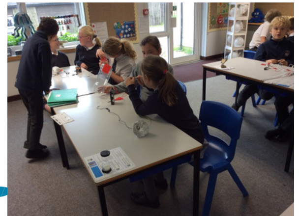
In Year 4 we have been creating our own torches with recycled items using our D&T and science knowledge we have learnt this year!