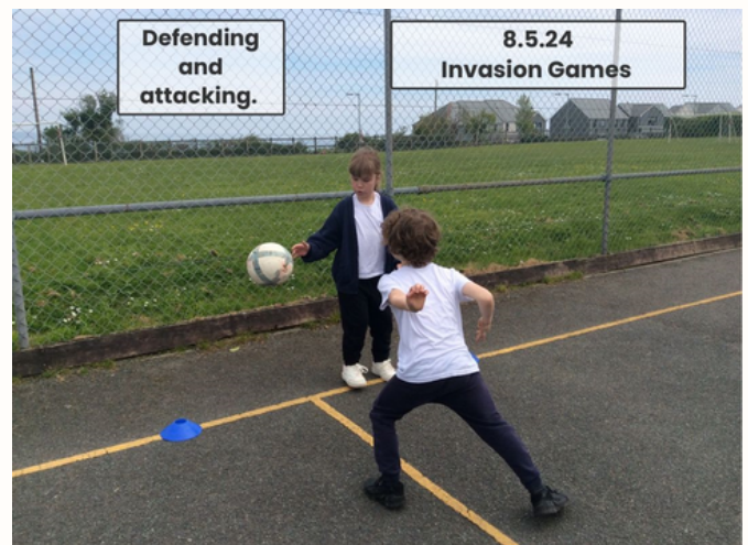
Dolphin Class learning how to defend and attack during their PE lesson this week.